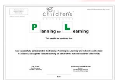
'Planning for Learning' validation certificate

'Planning for Learning' validators will be issued with a national Children's University™ certificate which entitles them to validate learning provision locally on behalf of the national CU and award 'Learning Destination' status. The certificates are linked to the national membership status of the local Children's University™.